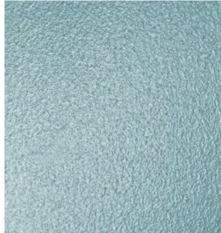
Curacao Sky █ 42 Base: 35312 Top Coat: 305