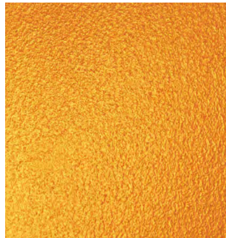
Valencia Orange █ 40 Base: 32201 Top Coat: 304