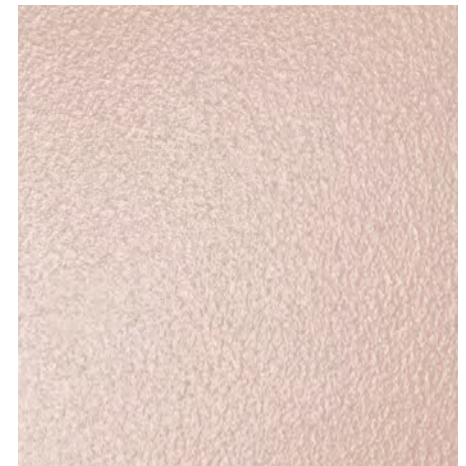
Akoya Pearl █ 69 Base: 33114 Top Coat: 301