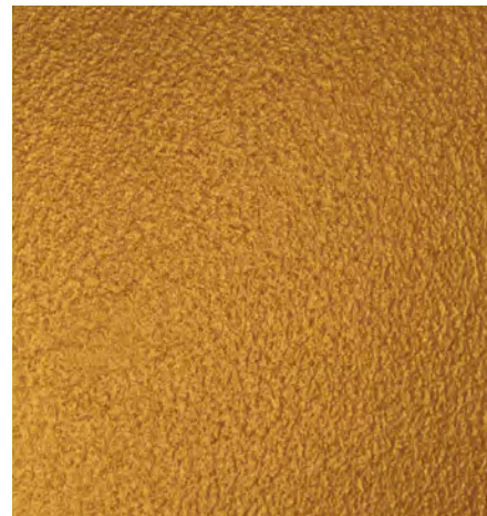
Colombian Copper █ 33 Base: 32241 Top Coat: 303