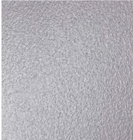
Patagonia Dusk █ 55 Base: 34321 Top Coat: 301