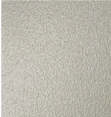
Lancaster Nickel █ 61 Base: 37204 Top Coat: 301