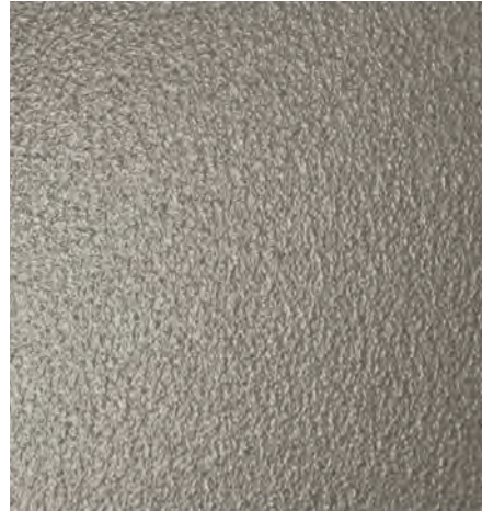
Revere Pewter █ 49 Base: 37202 Top Coat: 301