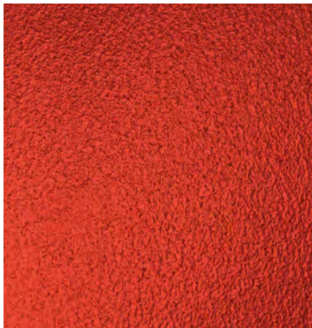
Shanghai Crimson █ 16* Base: VT206530 Top Coat: 306