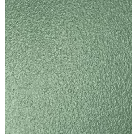
Havasus Teal █ 48 Base: 36120 Top Coat: 301