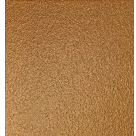
Keweenaw Bronze █ 31 Base: 32242 Top Coat: 303