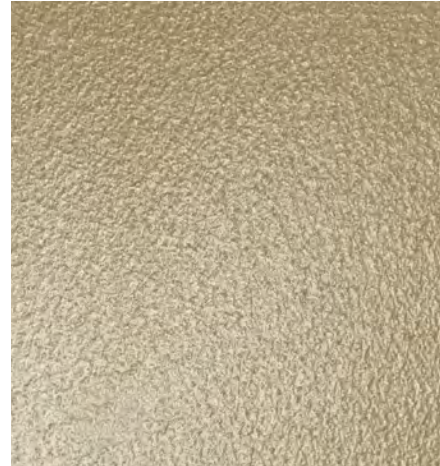
Sonoran Tan █ 63 Base: 31234 Top Coat: 301