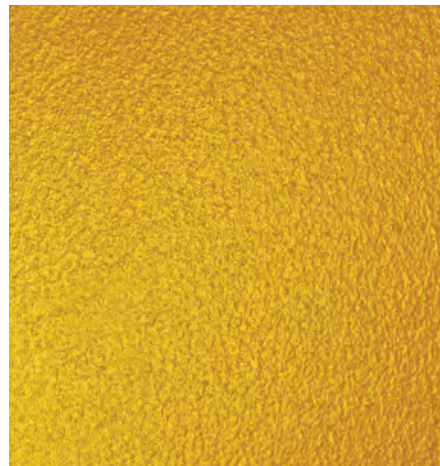
Luxor Gold █ 46 Base: 31300 Top Coat: 304