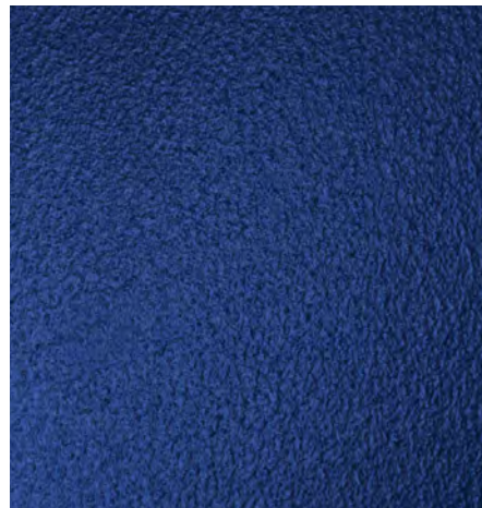
Cosmic Blue █ 12* Base: VT100057 Top Coat: 307