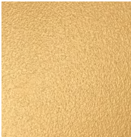
Bavarian Wheat █ 64 Base: 32113 Top Coat: 302