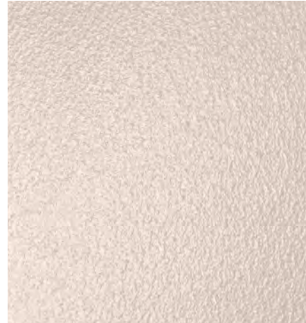
Italian Alabaster █ 77 Base: 16004 Top Coat: 301