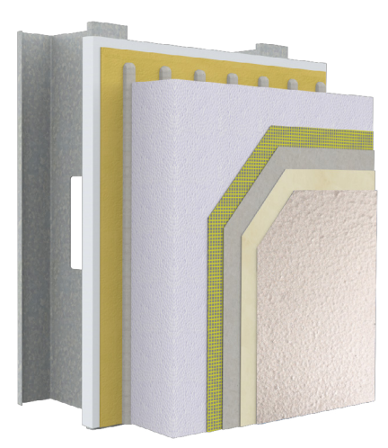
StoTherm® ci with Lancaster Nickel Metallic

Options abound with StoColor Metallic in both color selection and surface application. All 15 standard colors can be applied over smooth or textured surfaces offering the versatility to create a custom look while utilizing standard finishes. The result, however, is beyond standard, attaining a reflectivity and luminosity that previously could be only found in natural metals. The colors subtly shift as your perspective does, mimicking the manner in which light shimmers off metal surfaces. StoColor Metallic is a cost-effective solution for creating multiple facade looks while achieving continuous insulation in a single system.