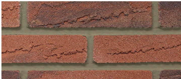
Arlington - S9.3900