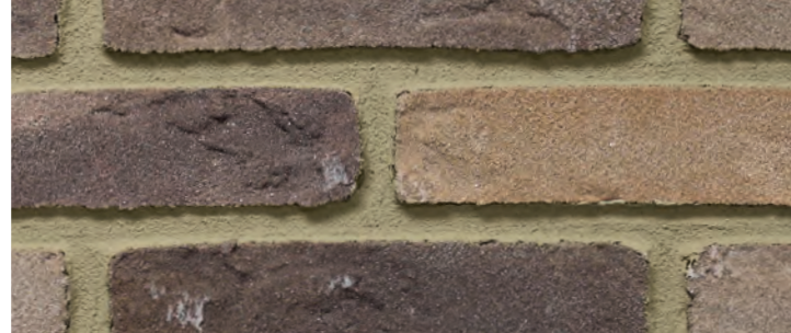
Hamilton - S9.6855