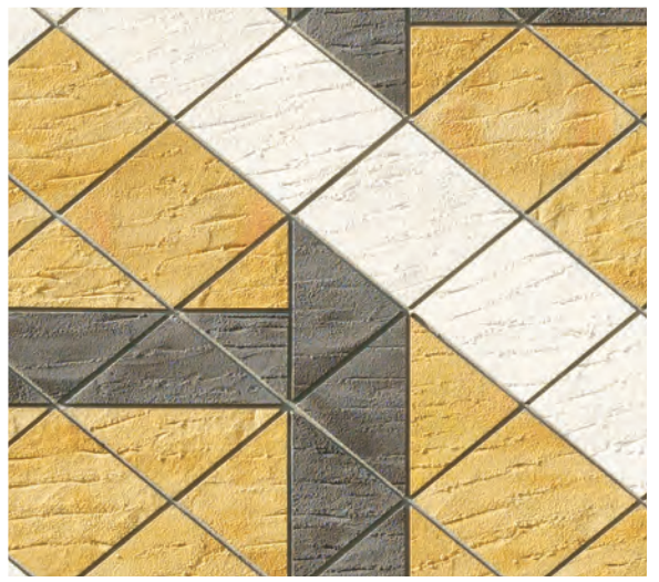
S9.10948 (grey) | S9.10949 (yellow) | S9.10950 (white)