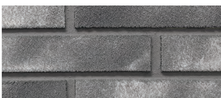
Leiria - S9.7227