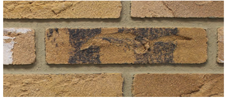
Westend - S9.6527