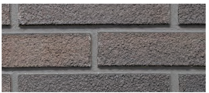
S9.5473 (Blue) | S9.1018 (Reds) Princeton - S9.8419