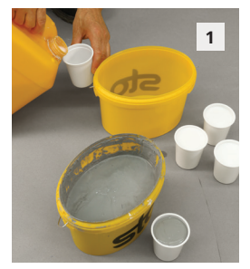
Dilute StoTique with water up to the maximum amount as indicated in the Product Bulletin. Stir StoTique frequently during its application. Note: if less water is used, StoTique will be thicker. This may be preferred and more suitable to created desired effect.

Roller, spray, sponge, brush or cloth applied glazing coating.