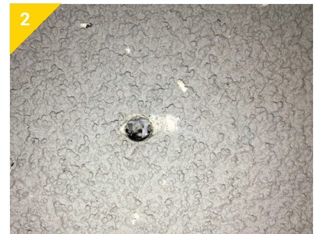
2. Competitor bird shield system penetrated after 14,579 impacts.

Impact Resistance is just one of many benefits offered by StoTherm ci Systems. Please also refer to our website to find out more about our unique finish designs, Sto Studio design services and the superior fade-resistance that characterizes the entire line of Sto finishes.