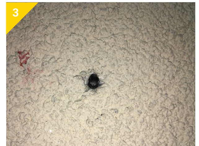
3. Sto IMPACT system not completely penetrated after 54,900 cycles.