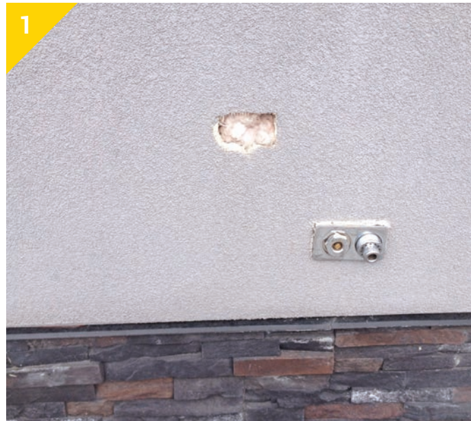
1. Example of impact damage from a shopping cart to a standard EIFS system.

Provide ultra high impact resistance - especially from woodpecker damage.